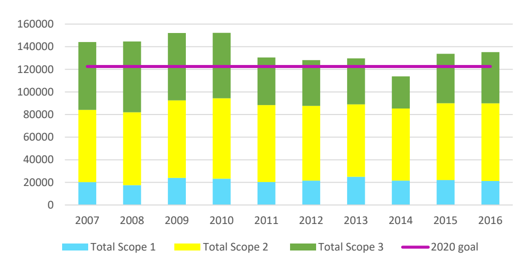
Figure 2: Emissions by Scope (MTeCO2)